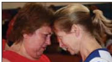
Blue Belles face off against Red Mamas