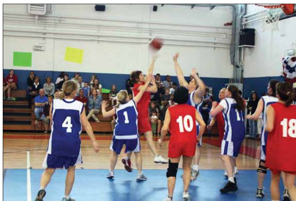
The Blue Bells and Red Mamas face off at the fitness center May 9.

Team possession changed, but only Voltan scored a free throw with 58